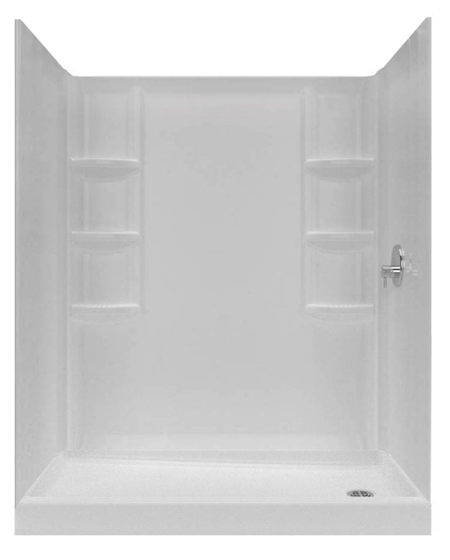
2946.SW Studio Shower Wall Set shown with 2946.STR shower base